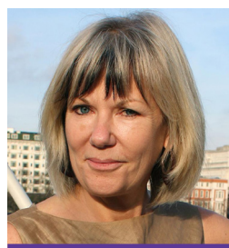
Jude Kelly CBE Founder of Women of the World Foundation