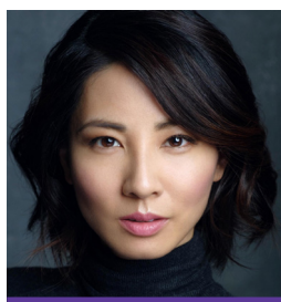
Jing Lusi Actress