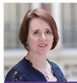
Kara Owen British High Commissioner to Singapore